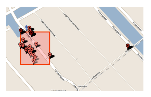
Figure 2: Bounding Box for the venue Melkweg in Amsterdam (NL)

We define the bounding boxes for the 9 venues selected in Table ?? and we crawl all photos taken at those locations during a one month period from May 1st 2010 to May 31st 2010. A collection of 4604 geo-tagged photos has been obtained. The number of geo-tagged photos hosted on Flickr represents only a tiny fraction of all photos shared online. In order to obtain more relevant photos, we also use the venue name as a query term for retrieving photos during the same period resulting in another 4589 photos (Table ??). Surprisingly, we notice that there are very few photos common to both queries. This shows that users seldom label their photos with a location name when geo-coordinates are available.